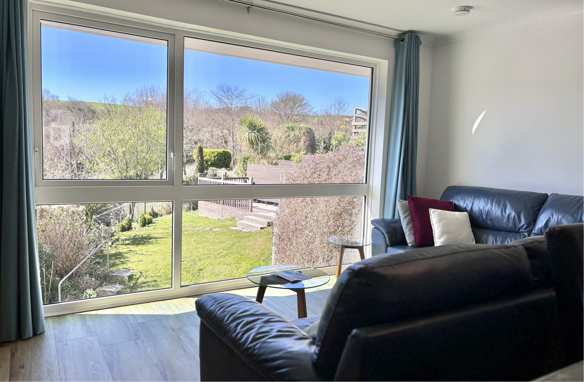
Woodgrove Park, Polgooth, St. Austell, PL26 7BN